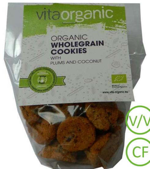
Organic wholegrain cookies Plums & Coconut

Ingredients: whole wheat flour 45%*, raw cane sugar*, prunes 15%*, non-hydrogenated vegetable fats*, coconut 4%*, raising agent: baking powder*, Himalayan salt