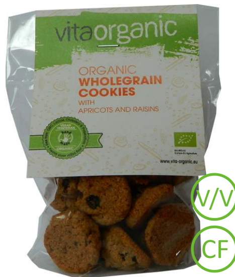
Organic wholegrain cookies Apricots & Raisins

Ingredients: whole wheat flour 45%*, raw cane sugar*, non-hydrogenated vegetable fats*, dried apricots 10%*, raisins 10%*, raising agent: baking powder*, cinnamon*, Himalayan salt;