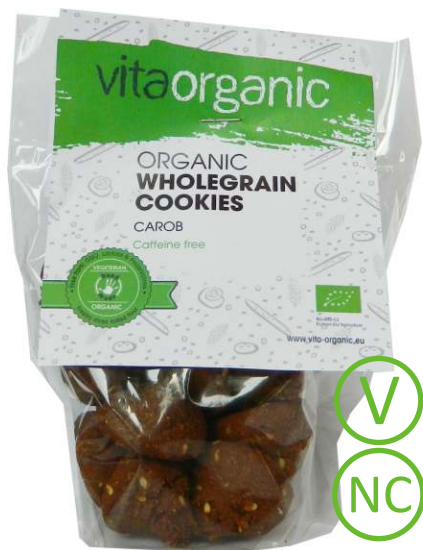
Organic wholegrain cookies Carob

Ingredients: raw cane sugar*, whole wheat flour 31%*, eggs*, carob flour 12%*, pure butter fat*, walnuts*, flavor: vanilla bourbon*, raising agent: baking powder*, Himalayan salt;